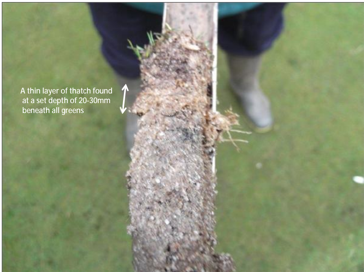
Photograph 2 – A typical soil profile found beneath greens showing a layer of thatch at a depth

It is therefore recommended that steps be taken over the coming year to start to physically remove and break down this layer of organic material. Whilst it is a relatively thin layer and not causing excessive problems, I do feel that year round performance would be further enhanced if this material could be gradually broken down.