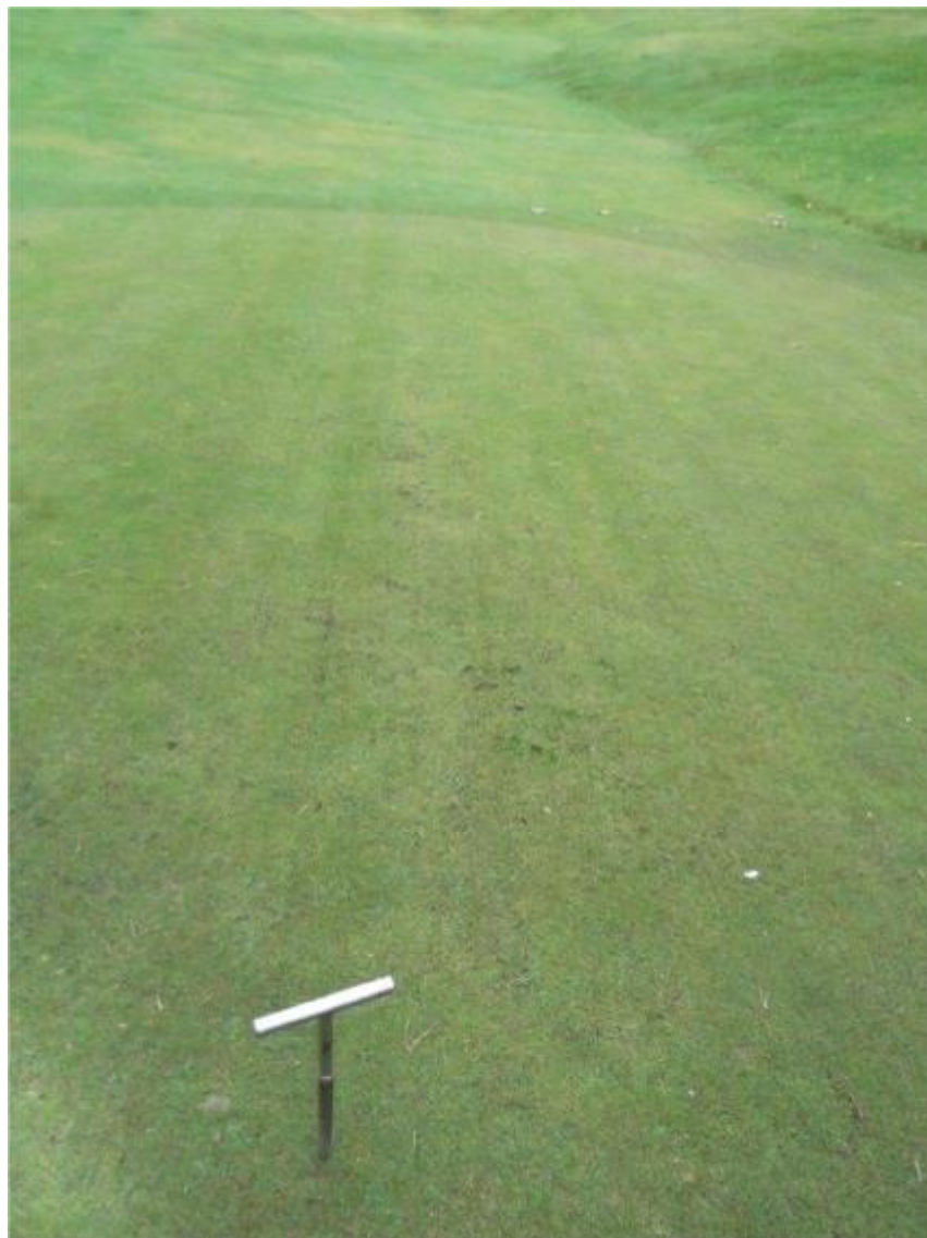
Photograph 1 - Typical moss establishment noted on the newer greens

Having assessed the surfaces it is recommended that fertiliser inputs on these three greens are increased during the growing season to strengthen sward density, reduce the opportunity for moss establishment and strengthen the turf against autumn disease pressures.